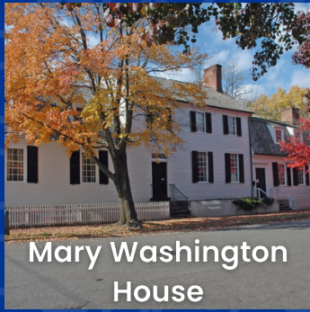
Mary Washington House