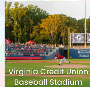
Virginia Credit Union Baseball Stadium