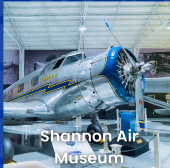
Shannon Air Museum