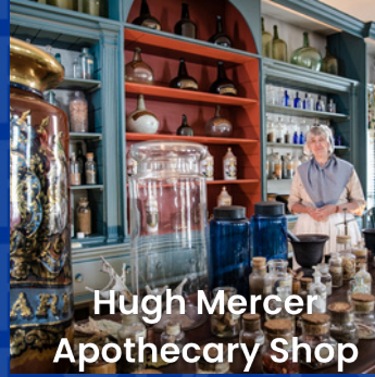
Hugh Mercer Apothecary Shop