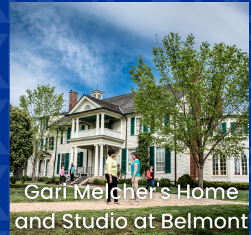
Gari Melcher's Home and Studio at Belmont