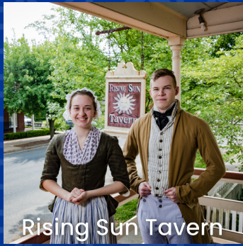
Rising Sun Tavern