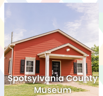
Spotsylvania County Museum