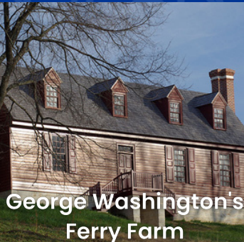
George Washington's Ferry Farm