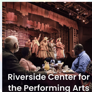
Riverside Center for the Performing Arts