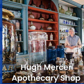
Hugh Mercer Apothecary Shop