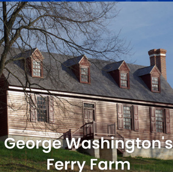
George Washington's Ferry Farm