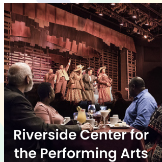
Riverside Center for the Performing Arts