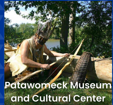
Patawomeck Museum and Cultural Center