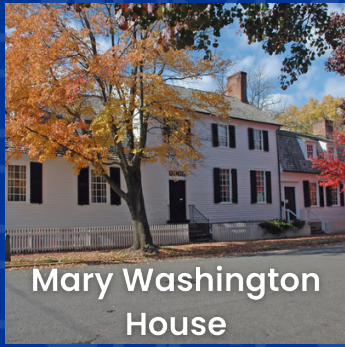
Mary Washington House