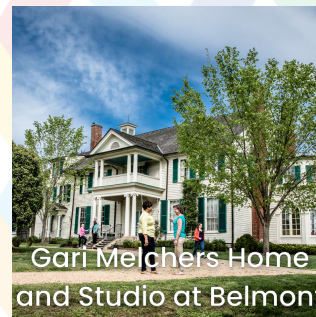
Gari Melchers Home and Studio at Belmont