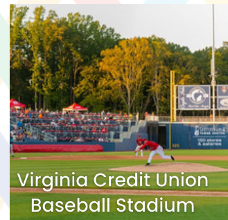
Virginia Credit Union Baseball Stadium