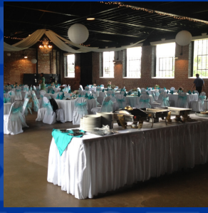
Inn at Old Silk Mill