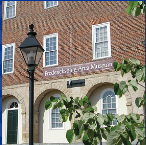
Fredericksburg Area Museum