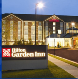
Hilton Garden Inn