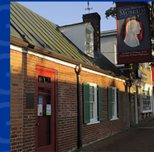
James Monroe Museum