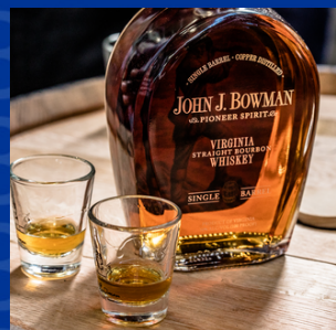
A. Smith Bowman Distillery