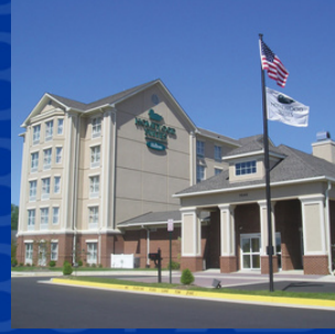
Homewood Suites by Hilton