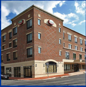
Courtyard by Marriott