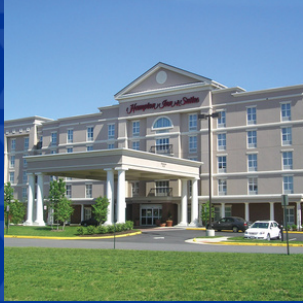
Hampton Inn and Suites